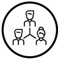
Direct Corporate Clients

Differentiate your property on quality, service and value, while being in complete control of your corporate relationships.