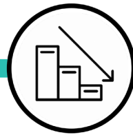
Reduced Booking Costs